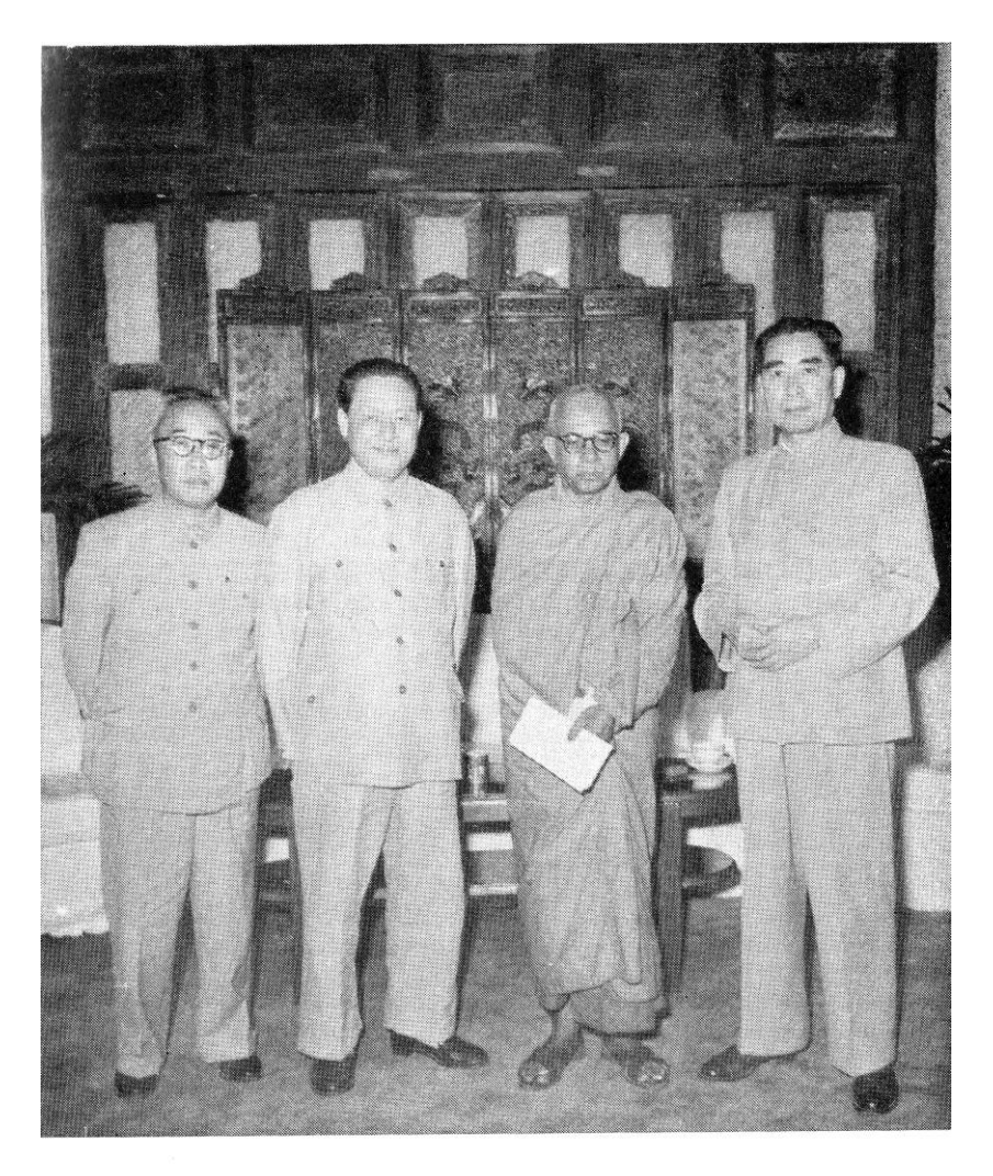
With Prime Minister Chou-En-Lai in Peking